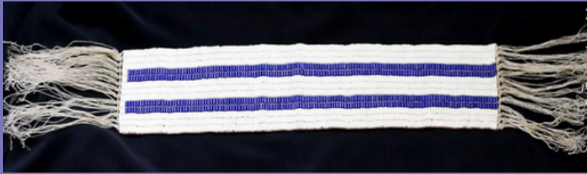
Two Row Wampum